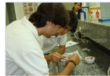
11th grade students discovering DNA