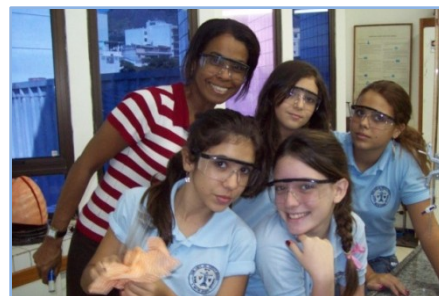
9th grade students looking at a demonstration of the electrical conductivity of ionic compounds.

The lab functions effectively due to the work of Lab Technician Flávia Ghiotti , who assists the teachers by preparing and organizing the laboratory.