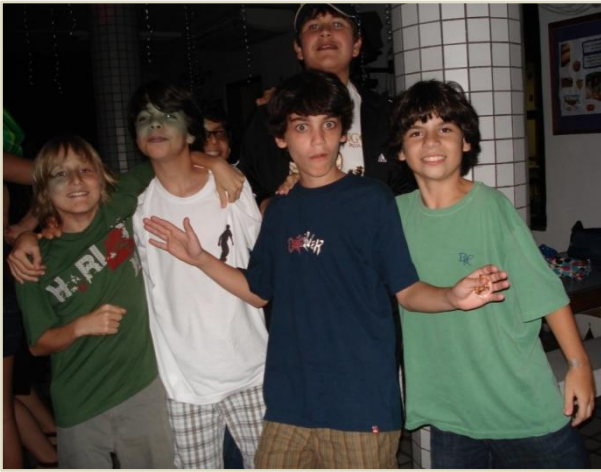
Simply the best!!