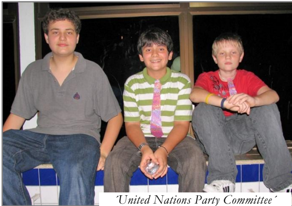
'United Nations Party Committee'