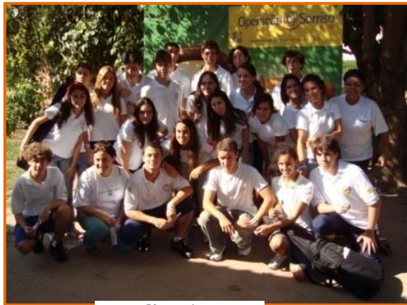
Class of '10

El pasado 15 de agosto, la clase de los "juniors" fue a brindar su apoyo en la campaña "Operação Sorriso", en la que entre risas y buenas intenciones lograron llevar a cabo una de las mejores actividades que ofrece el Colegio como servicio comunitario. Cada estudiante de forma diferente ofreció su ayuda al programa jugando con los niños, tocando un poco de