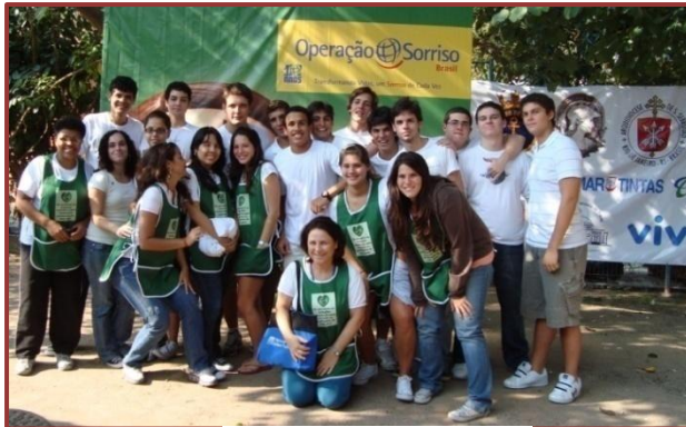
Class of '09

On August 15th the Junior class had the privilege of being part of Operation Smile: Brazil . The students went to the Ilha do Governador, to spend the day not just as volunteers to assist where needed, but as people wanting to make a difference in a child's life.