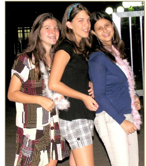
"You better shape up..."