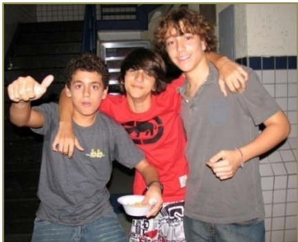
"You better understand... We are too young!"