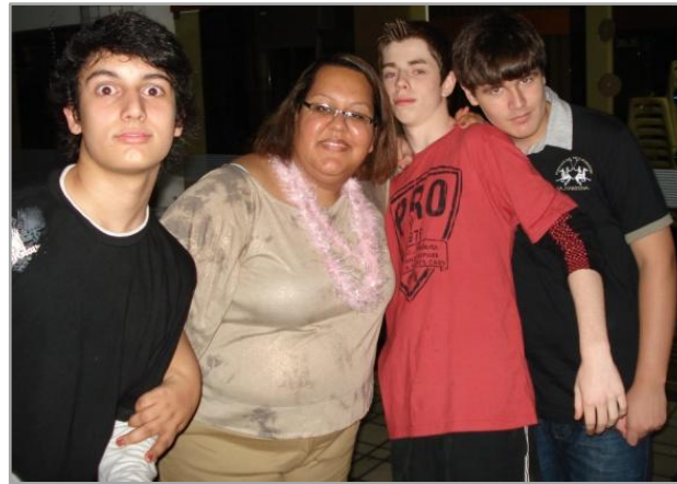
Even the freshies decided to show up!