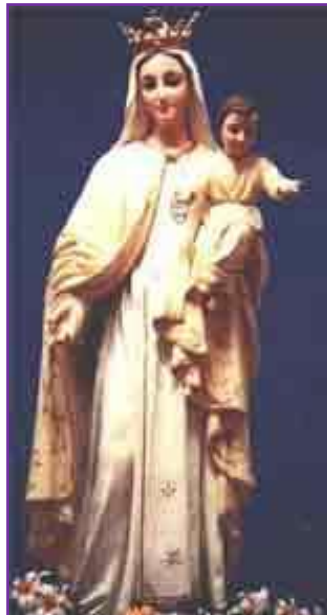
Image of Our Lady of Mercy

May all who venerate you feel now your help and protection. Be ready to help us when we pray, and bring back to us the answers to our prayers. Make it your continual concern to pray for the people of God, for you were blessed by God and were made worthy to bear the Redeemer of the world, who lives and reigns forever. Amen.