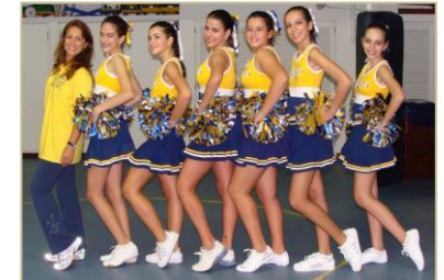
Middle School Team

Well, research here, research there, ask the experts, observe other squads and then, do it-hours of practice! After almost two years, we have our high school and middle school teams. In addition, we have recently added our elementary squad. (They started practicing by themselves during recess