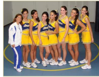
High School Team

As the OLM cheerleading coach for elementary, middle and high school girls, I am very proud to acknowledge the effort and all the accomplishments of these wonderful, beautiful athletes.