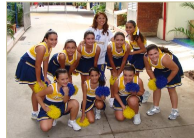
Elementary School Team

CONGRATULATIONS CHEERLEADERS! WE ARE PROUD OF YOU!